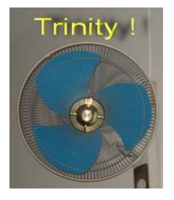
249 2 Corinthians

Father, Son and Holy Spirit, help me live the way you want me to live